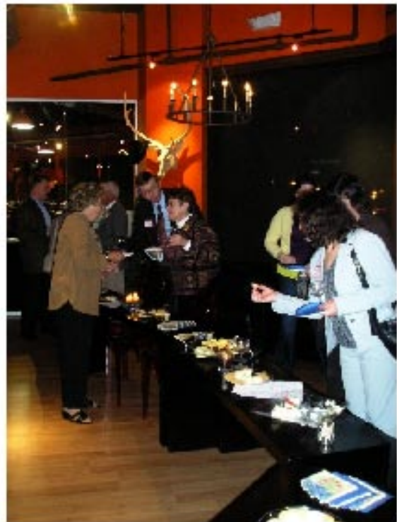
Members enjoy the festivities at the ICW Business Partners Wine Tasting