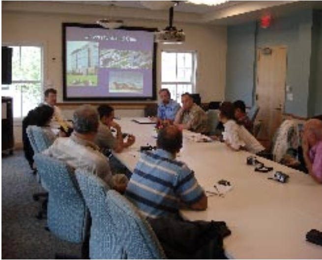
Azerbaijan Participants meeting at the Regional Family Health Center, Barre, Mass.

the Worcester Free Medical clinic, the Ronald McDonald Care Mobile, the Mass. Dept. of Public Health, the State Medical Laboratories in Jamaica Plain, the Lehman Center for Patient