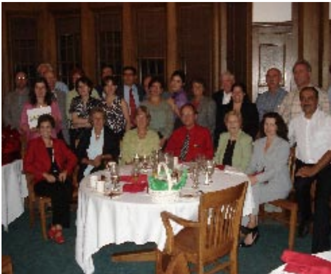
Azerbaijan Participants at the farewell dinner with host families and ICW staff at the Clark University Faculty Dining Hall.

Safety and Medical Error Reduction in Boston, the Massachusetts Medical Society, the New England Journal of Medicine, the City of Worcester Department of Health, the Worcester Water Treatment Plant in Holden, the Mass. College of Pharmacy, Quinsigamond Community College, Unicare Insurance Company, the Worcester Telegram & Gazette, Hospices Services of Western Mass., the Central